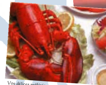
Vos délices préférés...

Note: Novacadie (Services in Acadian Cultural Tourism) is a travel intermediary involved in handling travel arrangements of other suppliers and is, therefore, not liable for the acts of the suppliers (e.g. hotels, restaurants, bus co., etc.) which are out of its control.