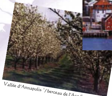
Vallée d'Annapolis / berceau de l'Acadie

Nova Scotia IS a "corner stone" of our great Canadian Heritage!