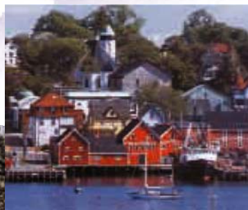
Lunenburg / Miriguèche

Novacadie Tours takes you through the eras with a blend of pleasure touring and discovery!