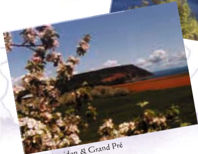
Cap Blomidon & Grand Pré